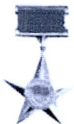
Hero of the People's Armed Forces