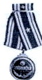
Third-class Independence Order