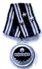
First-class Independence Order